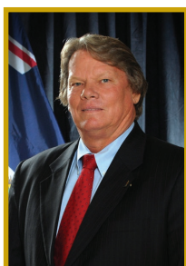
Hon. Moses I. Kirkconnell, JP, MLA Deputy Premier Minister for District Administration, Tourism and Transport First Elected Member for Cayman Brac and Little Cayman