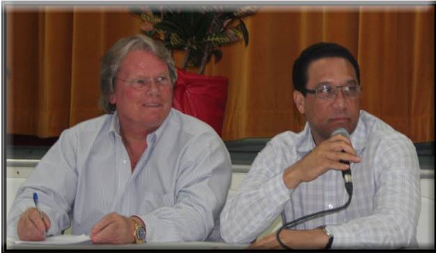
Deputy Premier and Sister Islands MLA Hon. Moses Kirkconnell and Premier Hon. Alden McLaughlin speak at a reception at the Aston Rutty Civic Centre on Cayman Brac while the Legislative Assembly was meeting on that Island in March 2014.

Legislative Assembly Meeting – Close to 100 people gathered at Aston Rutty Civic Centre in April 2014 to watch Members of the Legislative Assembly hold their meeting on Cayman Brac. It was the first time the LA had gathered in the Sister Islands since 2003.