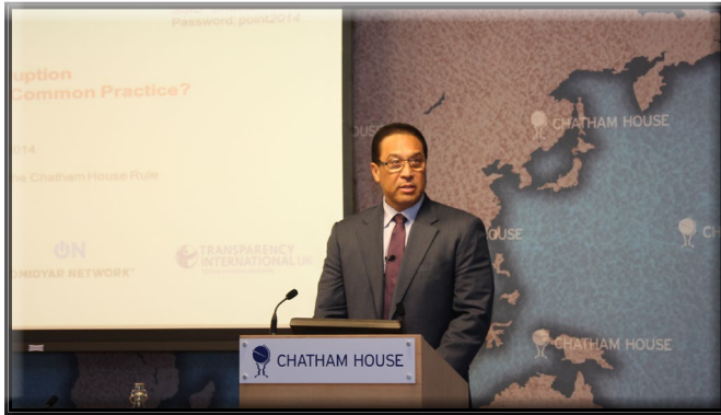
Premier Hon. Alden McLaughlin presented a speech on the topic Combatting Global Corruption at Chatham House in London, England, on Tuesday, 4 February, 2014.

Chatham House – The Premier was invited to give one of only two keynote speeches at Chatham House in London to address the topic, Combatting Global Corruption, in February 2014.