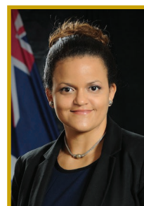
Hon. Tara Rivers, JP, MLA Minister for Education, Employment and Gender Affairs Second Elected Member for West Bay