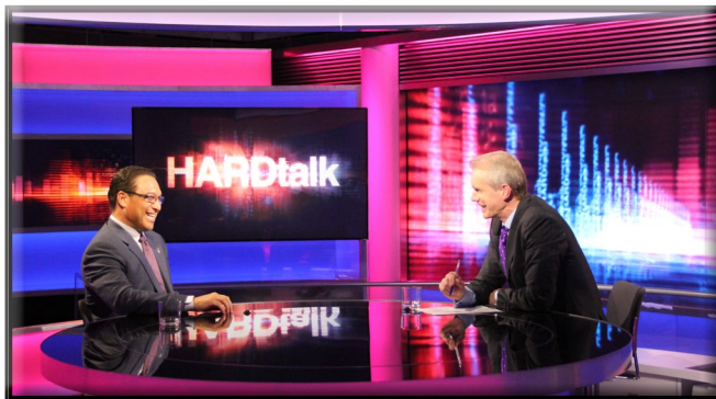
Premier Hon. Alden McLaughlin was interviewed by BBC HARDtalk host Stephen Sackur while in London in February 2014.

BBC HARDtalk – Also in February 2014, The Premier was invited to and appeared on the BBCs HARDtalk television show, which provides in-depth interviews with global leaders.