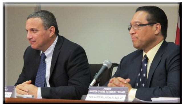
Deputy Governor Franz Manderson and Premier Hon. Alden McLaughlin discuss EY recommendations at a press conference on 9 September, 2014.

Project Future – Work has begun on key projects, including an Office of the Ombudsman; sale of surplus property; George Town landfill; airports; more effective Government communications; raising the retirement age for Civil Servants from 60 to 65; and creation of a Public Utilities Commission. Work is also well under way to review the remaining EY recommendations to determine which align with Government’s policy priorities and goals and to set in place the plans and resources needed to make the approved projects a success.