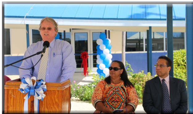
Deputy Premier and Sister Islands MLA Hon. Moses Kirkconnell addresses a crowd that turned out for the opening of the Charles Kirkconnell International Airport expansion in January 2015. Looking on are Speaker of the House and Sister Islands MLA Hon. Juliana O'Connor-Connolly and Premier Hon. Alden McLaughlin.

ribbon cutting to mark the occasion took place on 29 January, 2015.