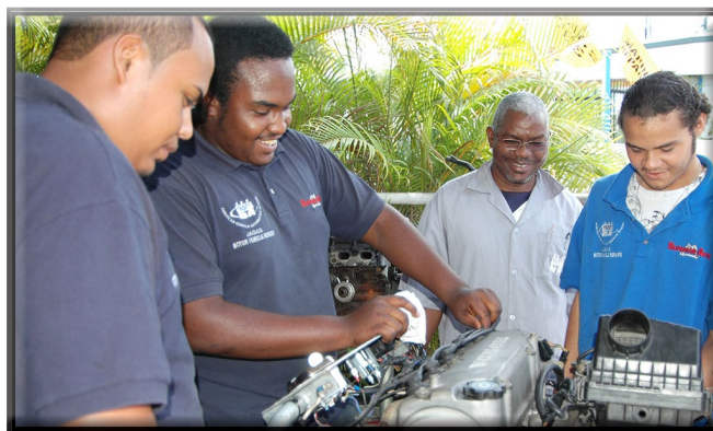
The Superior Auto Training Programme has the largest participating cohorts to date.

NWDA Training – At 30 April, 2015, there were 776 Caymanians seeking services with the National Workforce Development Agency; of those 508 were unemployed. Of those seeking the services of the NWDA 522 were seeking services as independent registrants and 254 were seeking access to the full services of the NWDA. There were 1,258 companies registered with the NWDA as of 30 April, 2015.