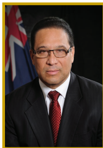
Hon. Alden M. McLaughlin, MBE, JP, MLA Premier Minister for Home Affairs, Health and Culture Third Elected Member for George Town