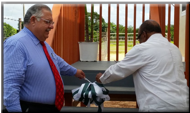
Minister for Agriculture Hon. Kurt Tibbetts welcomed the opening of Caribbean Agricultural Research and Development Institute's local office - a joint project with the Cayman Islands' Department of Agriculture - on 15 December, 2015.

Opening of CARDI Unit – In December 2014, Government welcomed the opening of Caribbean Agricultural Research and Development Institute's local office - a joint project with the Cayman Islands' Department of Agriculture. Among the staff, the facility employs two Caymanians who will contribute to the research and sharing of technical knowledge.