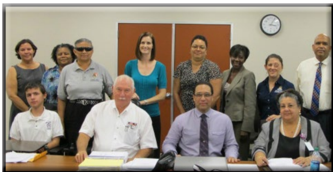
Members of the Disabilities Policy group met with the Premier in 2014.

Minimum Wage – The Minimum Wage Advisory Committee was convened in June 2014 and provided Government with a comprehensive advisory report in March 2015 on the steps necessary to establish a minimum wage and the effects of such a regime that would address exploitation and provide relief to the lowest paid workers. A Minimum Wage regime will be implemented in March 2016.