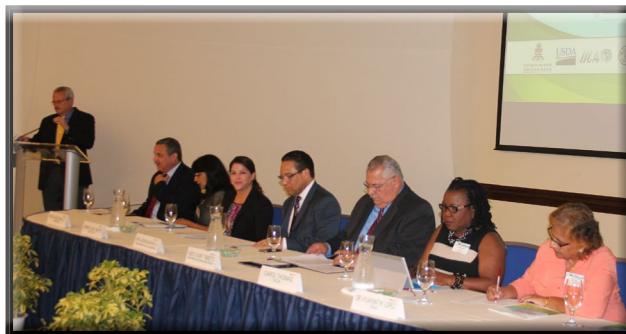
The seventh annual meeting of the Caribbean Plant Health Directors forum was held in the Cayman Islands from 29 July to 1 August, 2014.

Caribbean Plant Health Directors Forum – During the period of 29 July to 1 August, 2014, the DoA in conjunction with the Ministry of PLAHI hosted the seventh annual meeting of the Caribbean Plant Health Directors Forum. This was the first time that such a major regional agricultural meeting has ever been hosted in the Cayman Islands. During the period the second meeting of the Plant Health directors of CARICOM was also held. At the CPHD meeting the Cayman Islands was elected to be the chair of the CPHD for the next two-year period, another first for the Cayman Islands.