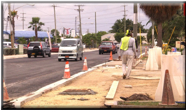
Work got under way on Godfrey Nixon Way in spring 2015.

Road works – Widening of Godfrey Nixon Way to give it three lanes – two directional and a centre lane for turning into the numerous businesses along that bustling stretch of road and a smoother traffic flow. Similar work is planned on Smith Road. Work in East End includes Sunny Field Extension to Reef Point, High Rock Drive, Farm and Winters Land roads; Rum Point Road in North Side; Anton Bodden Drive in Bodden Town; 13 roads in West Bay including Birch Tree Hill; 27 roads in George Town including Canal Point Road, Sparky’s Drive, Red Gate Road, Owen Roberts Drive and Shamrock Road.