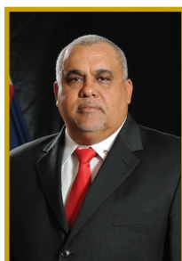
Hon. Osbourne V. Bodden, JP, MLA Minister for Community Affairs, Youth and Sports Second Elected Member for Bodden Town